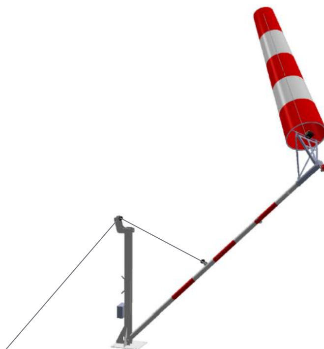
Tiltable mast for maintenance