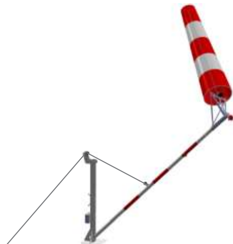
Tiltable mast for maintenance